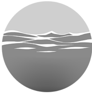
Surface of a Lake

2. Circle the objects that reflect light.